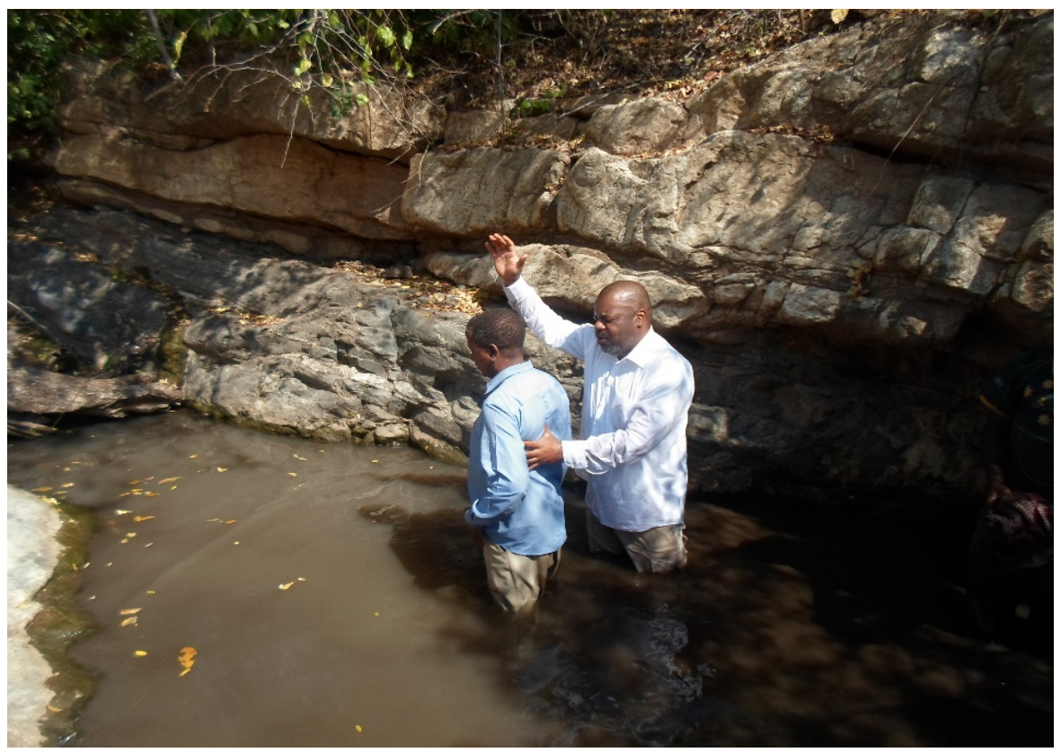
MYANMAR (formerly BURMA)

It is always He who led, he opened a wide door in Asia precisely in Myanmar. I did not know this country, I received an invitation from a Burmese in Myanmar. He wrote to me from home to invite me and bring the Word of God, it was the Lord who had led him, so he had got my address to contact me. When I went there, I brought the gospel of Christ, souls believed and were baptized. There are many souls there today and I am expected not only in the capital Yangon, but also in Kalaymio, Ngangaw and Chin State. We even contributed to build a church there. God is at work. It is really wonderful to see how He opens the doors himself. "I opened a door before you that no one would close".