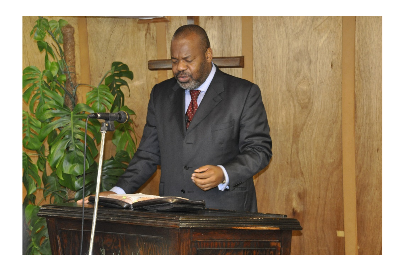
Happy New Year 2017 to all of you!

May the rich blessings of the Lord be granted to you.