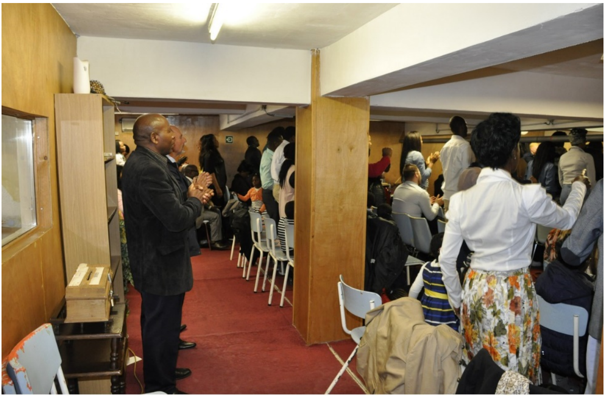
International Mission Center @2016

The devil had decided to destroy the local Church again, brothers and sisters had left us, the church was almost empty, but this is what it looks like today.